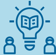
Open Pedagogy Basics