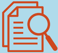
Making the Case for OER

Build your own workshop or online webinar series tailored to your organizational goals. In-person facilitation available on request!