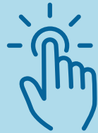
Interactivity with H5P